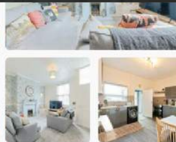
3 Bed Terraced House, Howarth Street, WN7